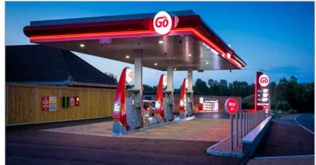
For Indicative Purposes Only

Subject to Contract and Exclusive of VAT © Lambert Smith Hampton January 2018