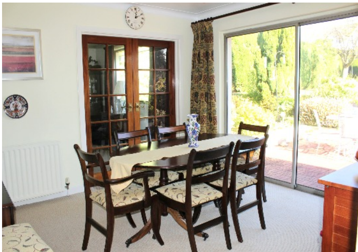
Dining Room 11'09"x 11'04" Sliding Patio Doors