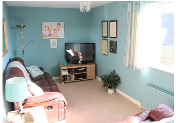
Family Room 17'08"x 9'00" Superb Views