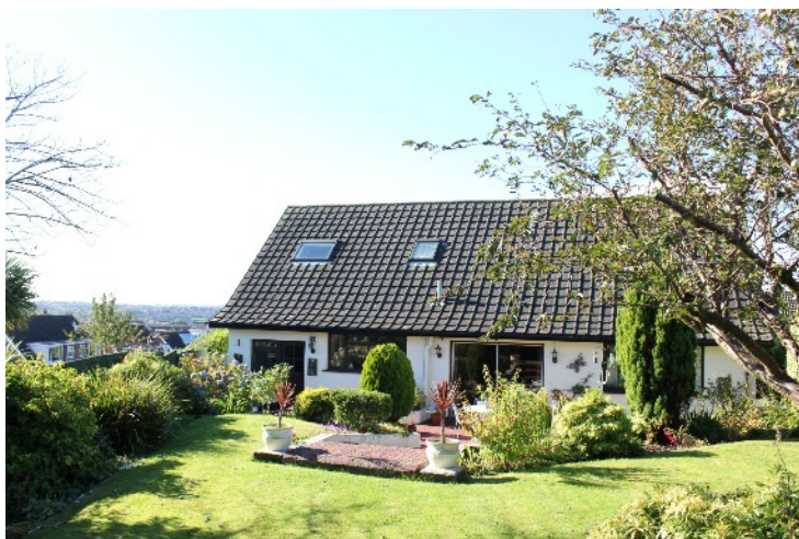
Rear Elevated Lawns With Spectacular Views

Directions: Proceeding along the High Bangor Road away from Bangor, turn left into Ballymaconnell Road South, take the 2 nd right into Towerview, proceed and Towerview Court is on the right handside, No1 is at the end of the lane.