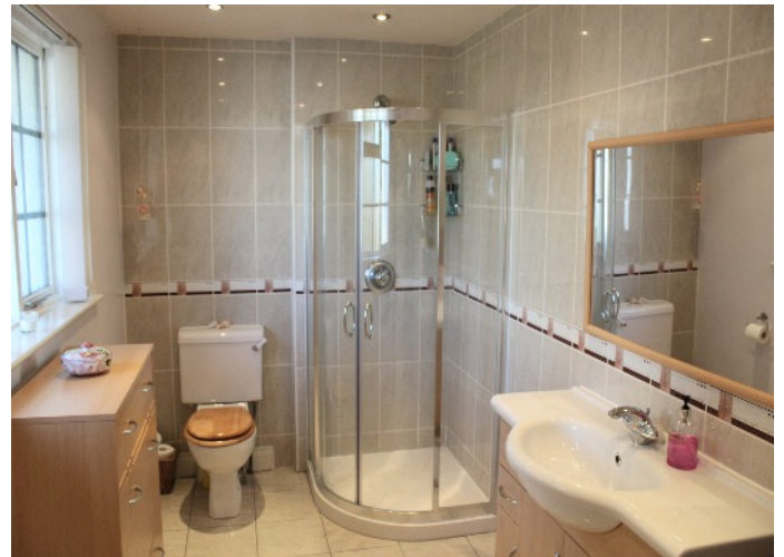
En-Suite Shower Room 11'00"x 6'03"