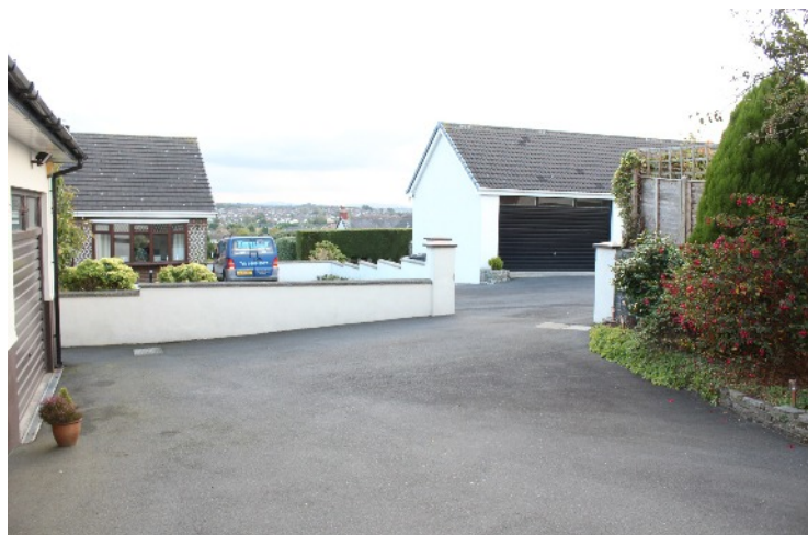
Front Generous Driveway and Porch