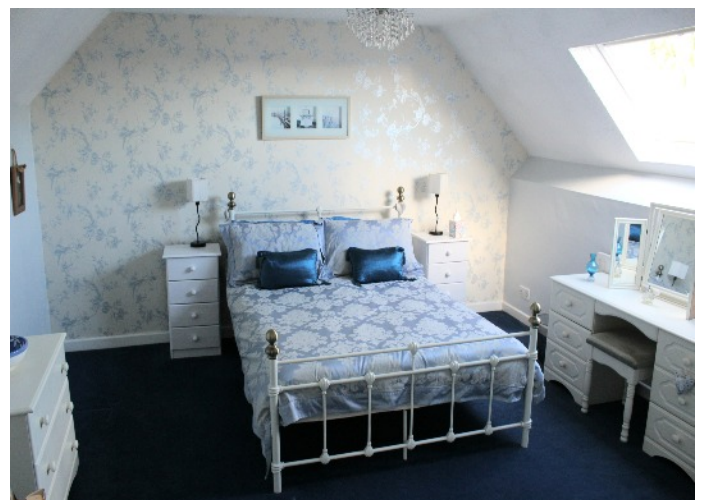
UPSTAIRS - Bedroom Three 13'06"x 13'05"