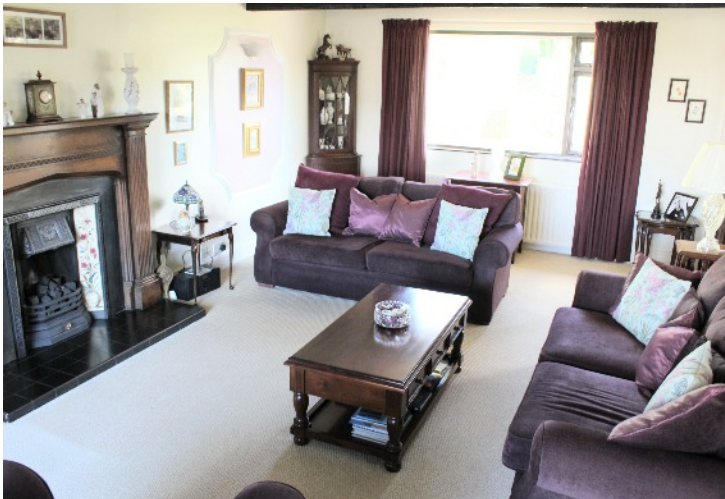
Lounge Room - Solid Wood Surround Gas Fire

Gordon Smyth Estate Agents are delighted to present this Fabulous Spacious Detached Bungalow Nestled in mostly Private manicured grounds perched at the end of a private driveway. Located in the ever popular Towerview Area, this four bedroom property enjoys some of the best views on offer in the Bangor area from the side and rear of the property toward Scrabo Tower and The Mourne Mountains.