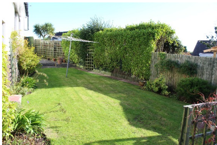
Side Garden With Patio Area With Stunning Views