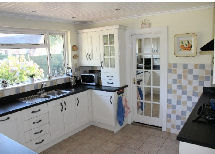
Kitchen 11'09" x 11'08" Integral Oven & Gas Hob

Three well presented reception rooms, master bedroom with a superb en-suite shower room and walk in wardrobe, Fitted kitchen open into dining room and utility room, all downstairs this property can be enjoyed as a bungalow, alternatively upstairs if required benefits from two spacious Bedrooms and bathroom suite.