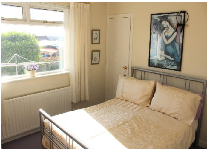
Bedroom Two 10'03"x 9'01" Built in Wardrobe