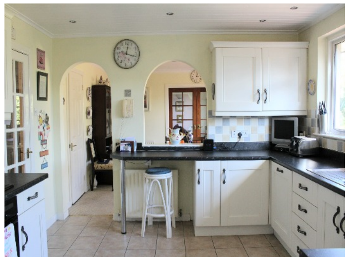
Breakfast Bar in Kitchen With Built In Dishwasher