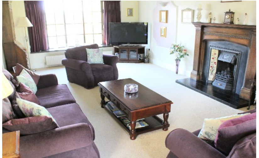
Lounge Room - 26'08" x 13'04"