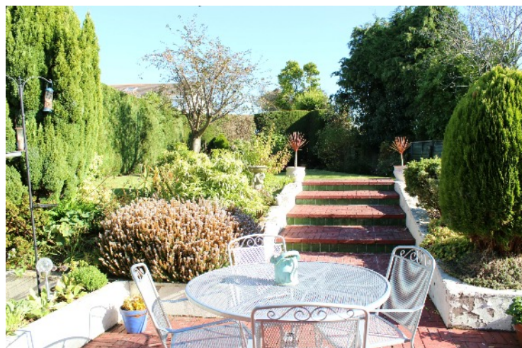
Rear Manicured Lawn With Extensive Patio Area