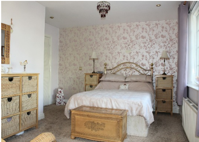
Master Bedroom 14'06"x 12'03" Walk In Wardrobe