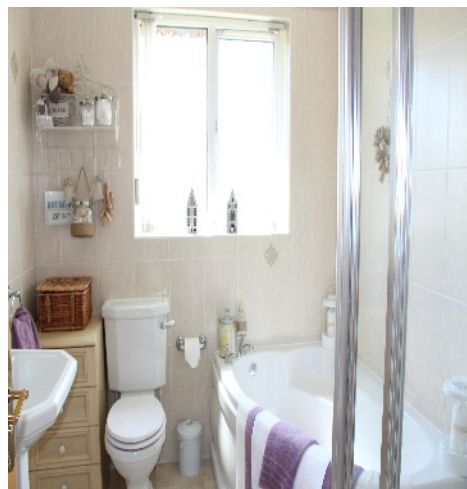
Bathroom - Four Piece Suite