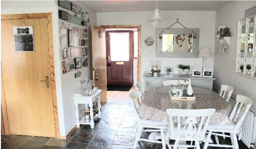
Dining Area In Kitchen - Under-stair Storage