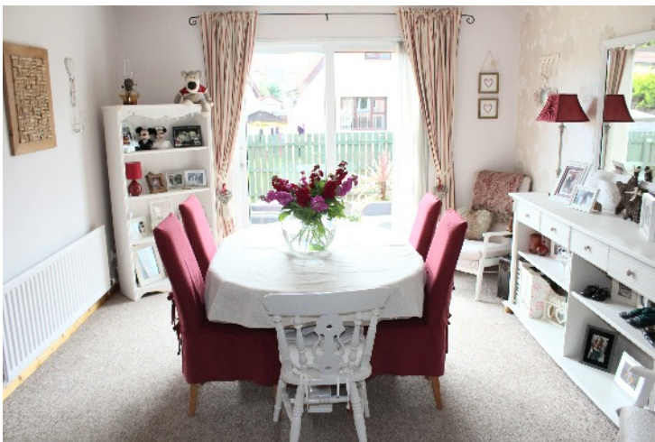
Dining Room 11'08" x 13'04" - Sliding Patio Doors To Rear Garden