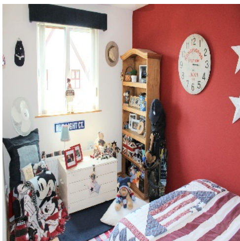
Bedroom 3 13'03" x 8'05" Rear Aspect