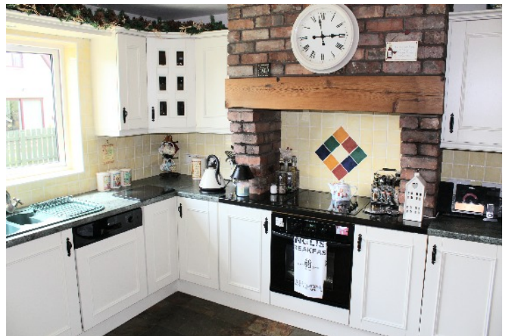
Kitchen 19'08" x 11'08" max