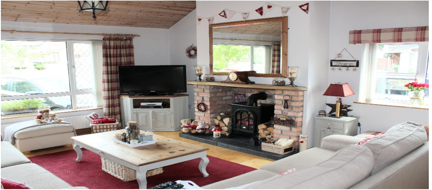
Family Room - Feature Brick Surround Fireplace