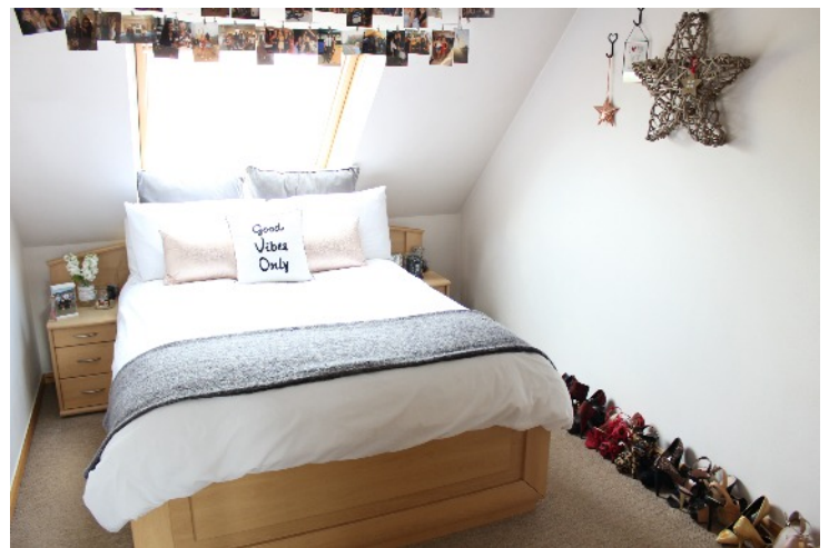
Bedroom 2 12'09" x 8'07" Front Aspect