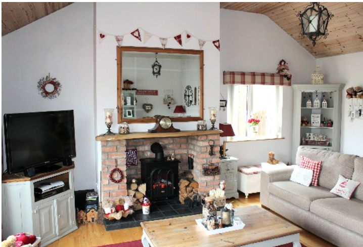
Family Room 18'04" x 16'.10"