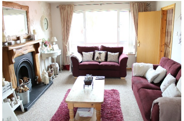
Living Room 11'08" x 14'04" - Open Fireplace