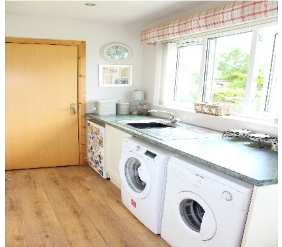
Utility Room 12'04" x 9'10"