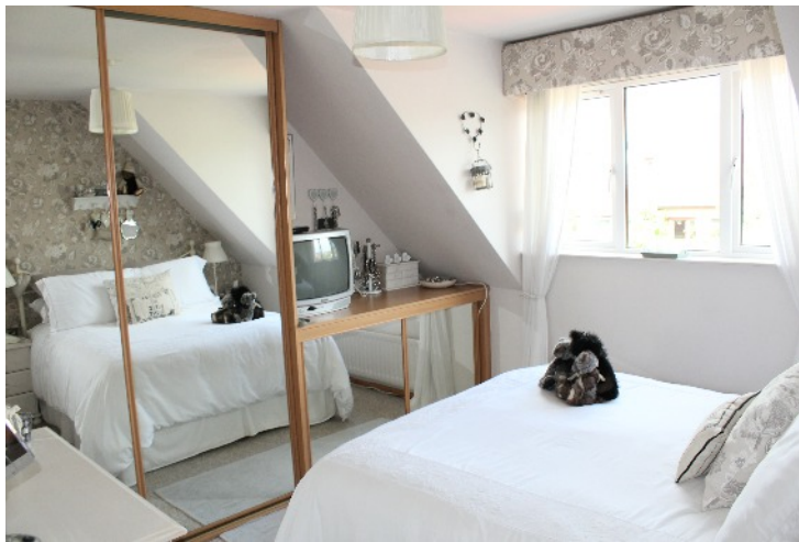
Master Bedroom 11'08" x 10'11" Built in Mirrored Slide-robos