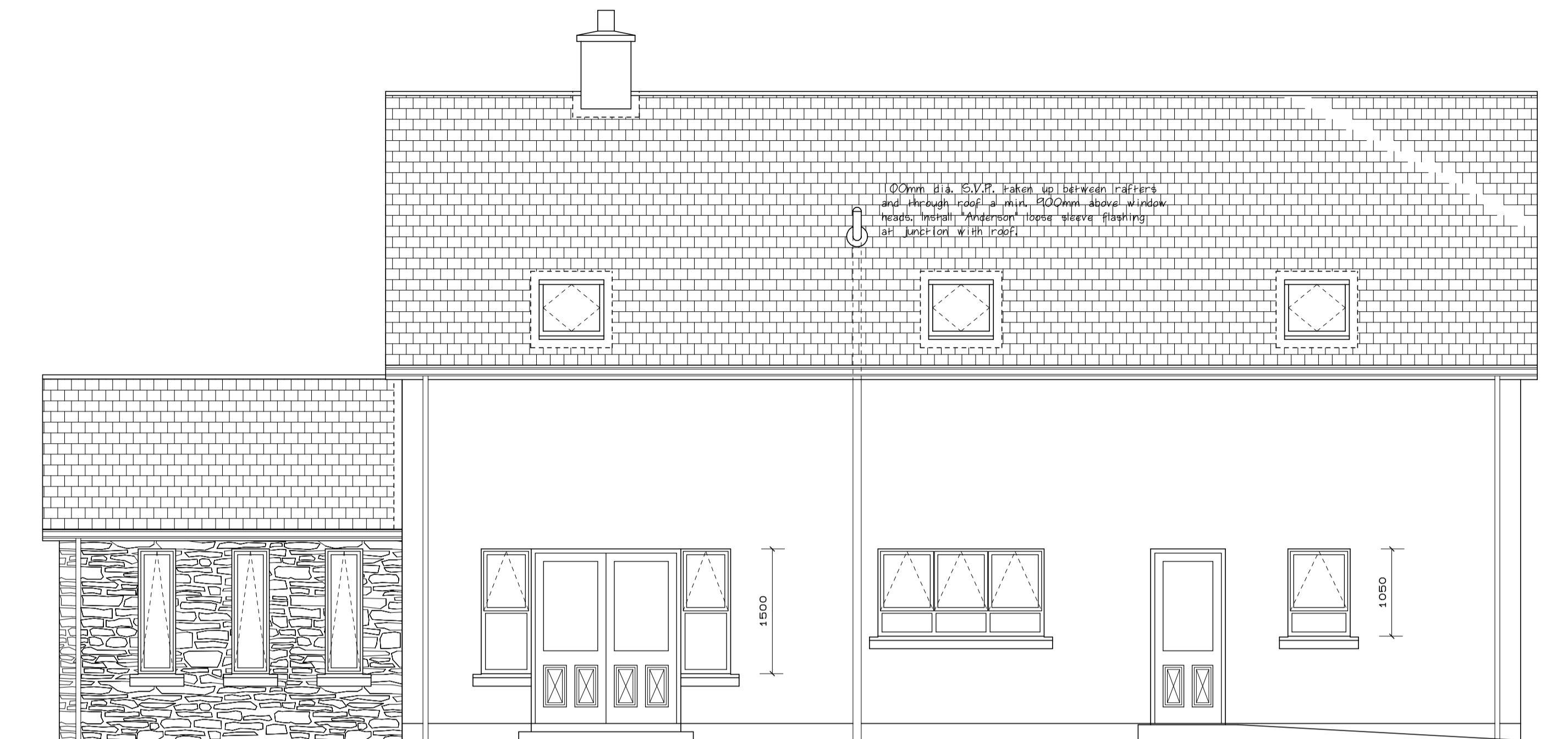
PROPOSED REAR ELEVATION FROM NORTH