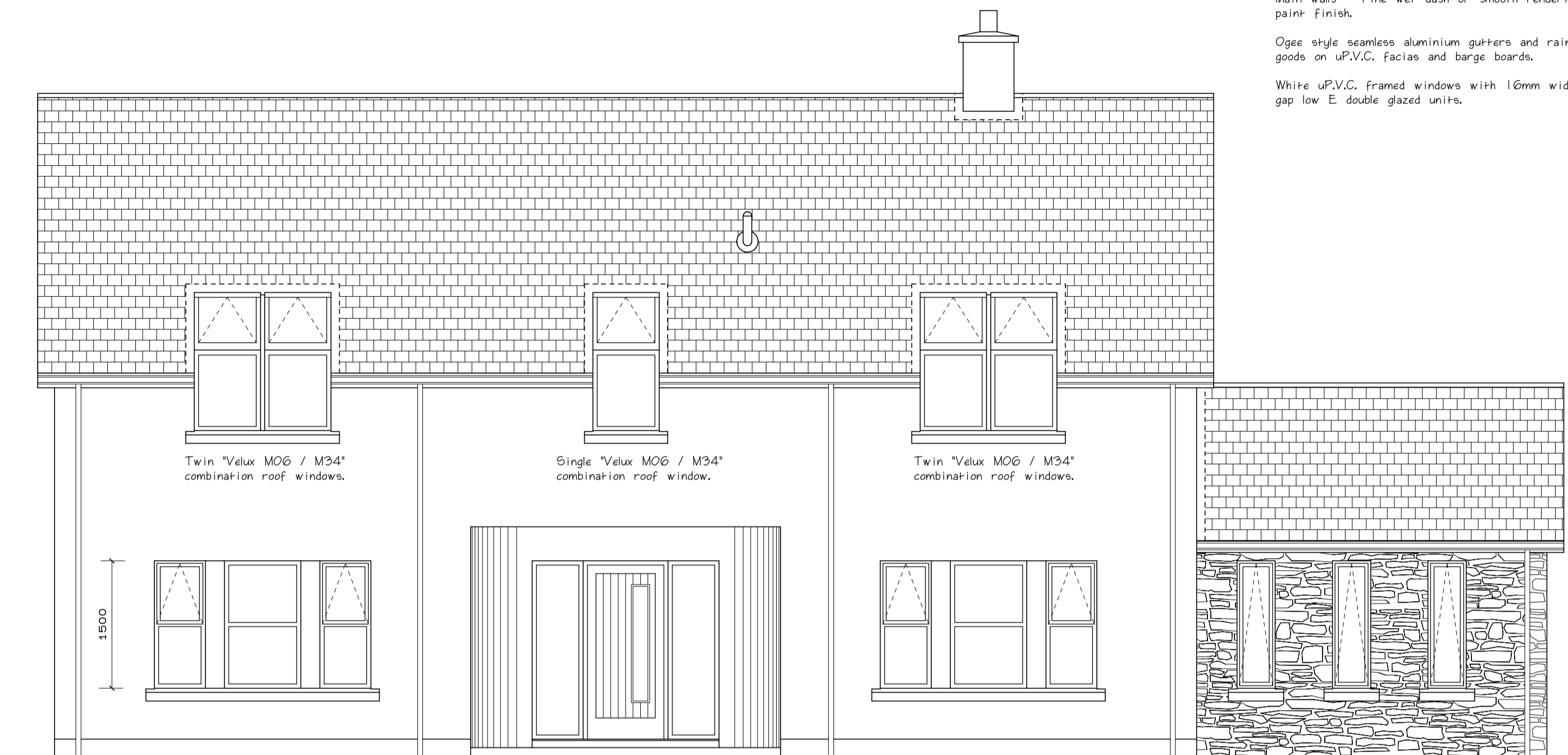
PROPOSED FRONT ELEVATION FROM SOUTH

Schedule of finishes :- Roof - flat profile concrete tiles colour 'Premier black' or 'Slate grey' as supplied by 'Scotts roof tiles Ltd' or equal and approved. Main walls - Fine wet dash or smooth rendering for paint finish. Gable style seamless aluminium gutters and rainwater goods on u.P.V.C. fascias and barge boards. White u.P.V.C. framed windows with 16mm wide gap low E double glazed units.