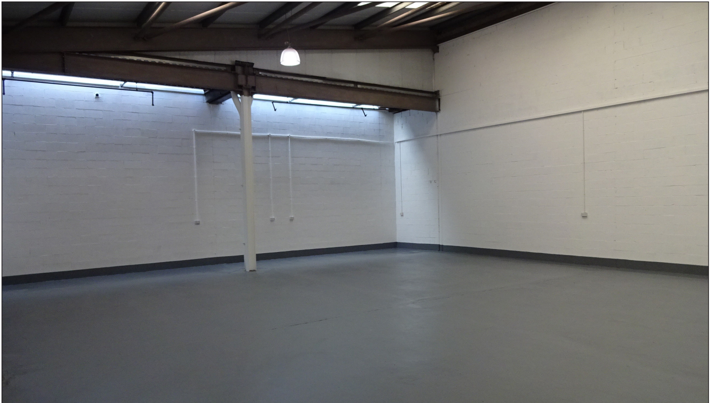
TYPICAL HIGH SPECIFICATION OF UNITS