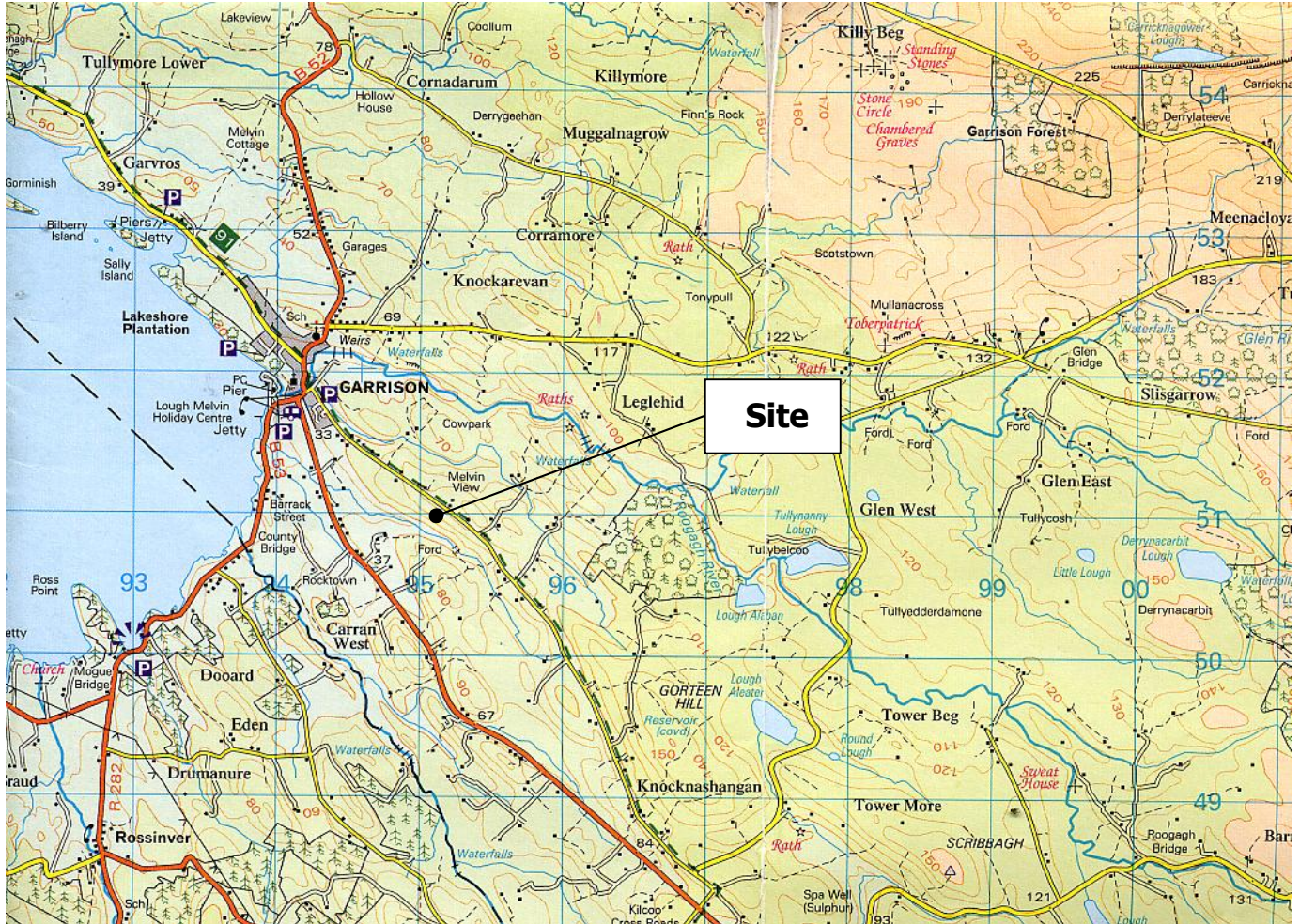
LOCATION MAP For Identification Purposes Only