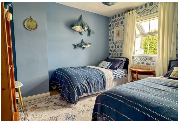
BEDROOM 4 7'7" x 5'9"