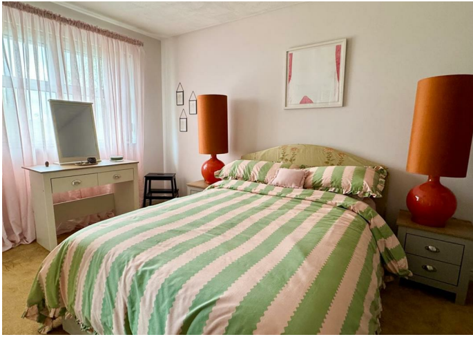
BEDROOM 2 13'10" x 9'6"