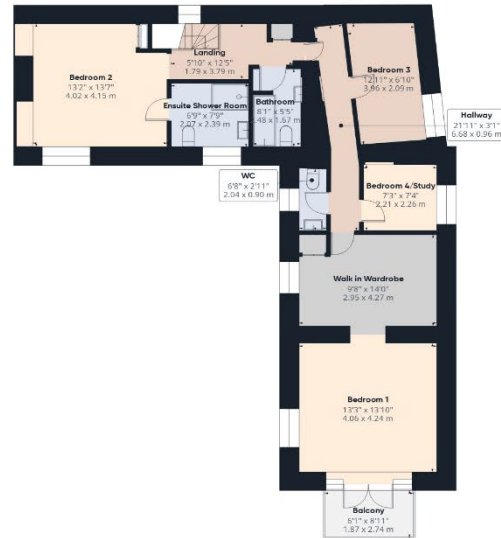
Floor 1 Crockwood Farmhouse