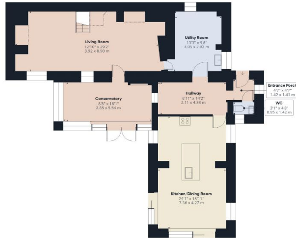
Floor 0 Crockwood Farmhouse