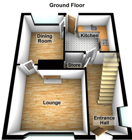
Images for illustrative purposes only and subject to change. Plan produced using PlanUp.