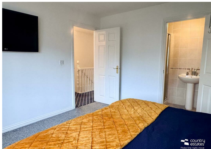
BEDROOM 2 12'10" x 11'6"