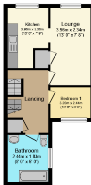
Flat 2 Floor area 39.4 m 2 (424 sq.ft.)