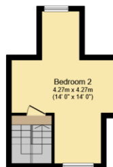
Flat 2 Floor area 20.2 m 2 (218 sq.ft.)