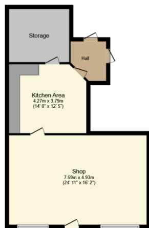
Ground Floor Floor area 67.7 m 2 (729 sq.ft.)