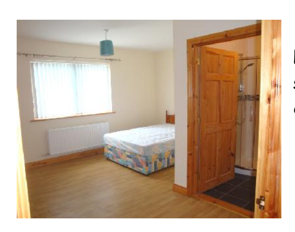
Bedroom No 1: 14'5'' \times 13'6'' inc. ensuite.

Layout provides for 2 piece suite and separate shower cubicle.