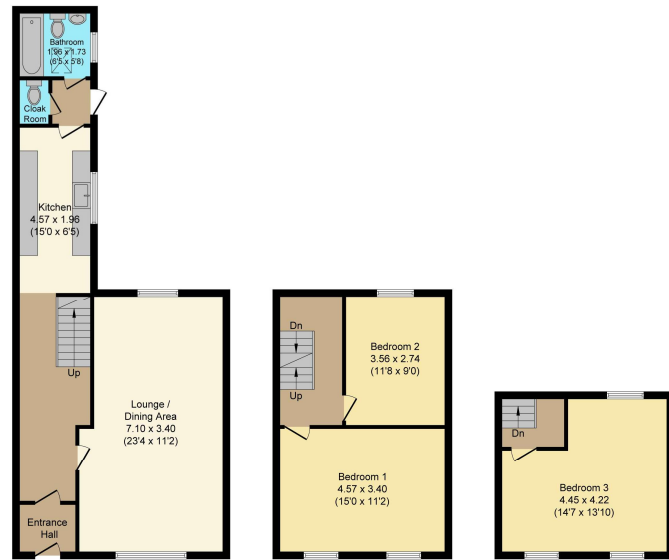
Ground Floor Floor area 55.30 sq.m. (595.24 sq.ft.) First Floor Floor area 32.40 sq.m. (348.75 sq.ft.) Second Floor Floor area 19.30 sq.m. (207.74 sq.ft.)

Total floor area: 107.0 sq.m. (1151.73 sq.ft.)