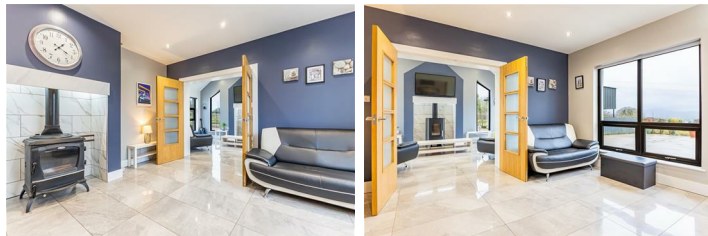
Family Area 9'7" x 13'3"

Part of the kitchen dining area. Large Stanley boiler stove with tiled surround. Double doors to sunroom and large picture window.