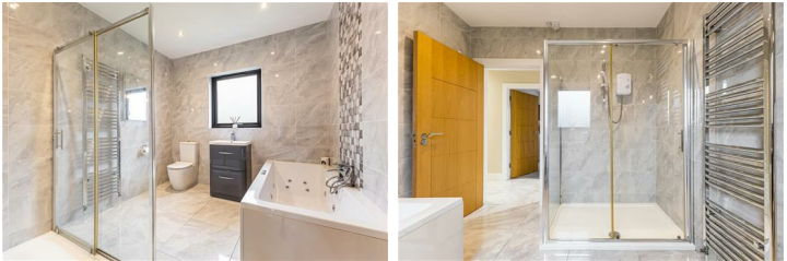
White sanitaryware, Floor to ceiling tiling. Heated chrome towel rail. Grey high gloss sink unit with drawer storage and chrome mixer tap. Wall mounted mirror. Electric shower enclosure, white whirlpool bath with grey feature tile and mixer tap with shower attachment.