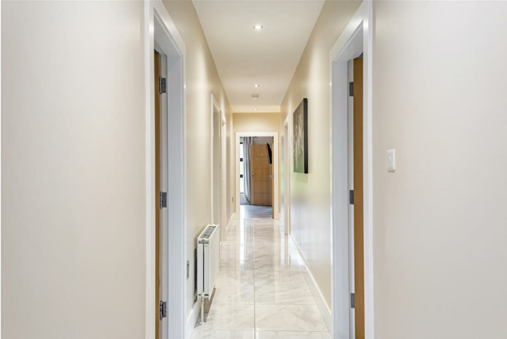
High gloss tile with spotlighting and double radiator.