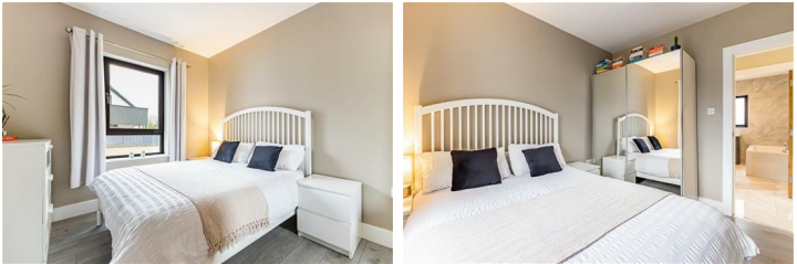
Wood laminate flooring with double radiator.