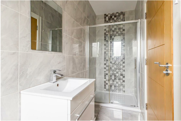
White sanitaryware, Floor to ceiling tiling. White high gloss sink unit with drawer storage and chrome mixer tap. Wall mounted mirror. Electric shower enclosure with grey feature tile.