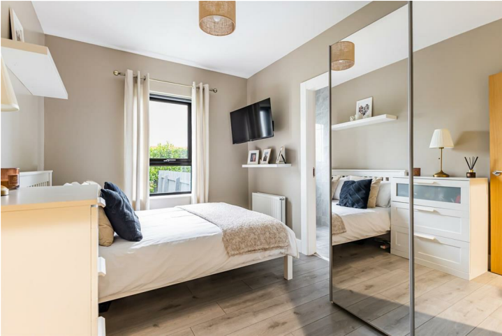
Wood laminate flooring with double radiator and TV mount. Mirrored sliding built in wardrobe.