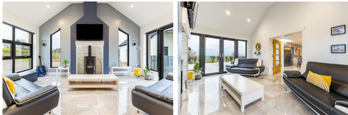
Sunroom 13'3" x 17'1"

Contemporary multi-fuel stove with tiled surround and window detail. TV mount above fireplace, high vaulted ceiling with spotlighting and high gloss tiling. French doors to outdoor patio area.