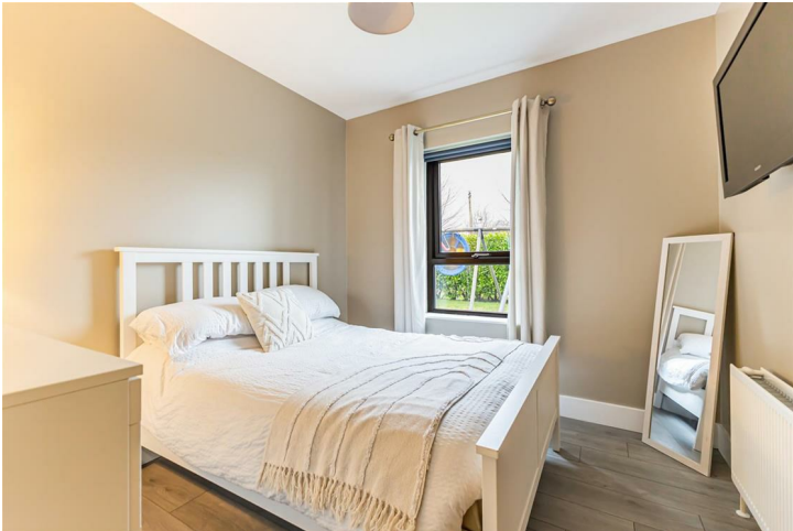
Wood laminate flooring with double radiator and TV mount.