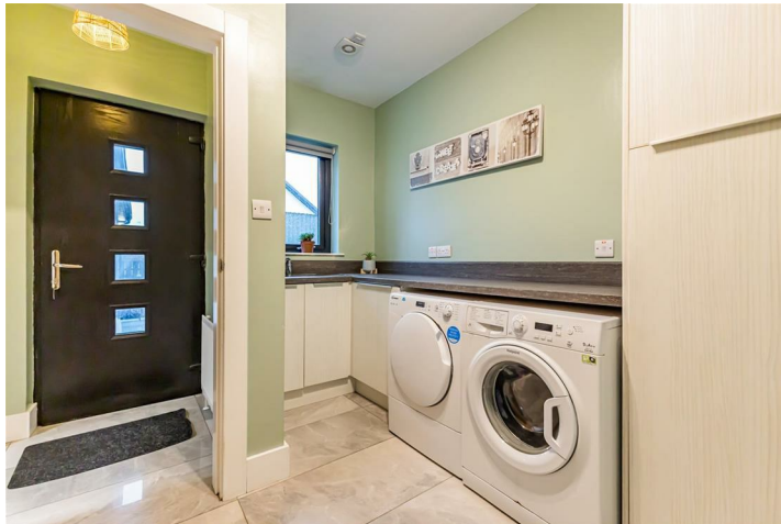
Utility Room 10'9" x 8'4"

Access out to back door. High gloss floor tiling with contemporary units, grey quartz worktops with upstands. Sink with mixer tap and extractor fan.