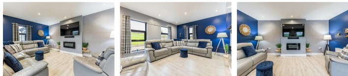
Living Room 16'8" x 13'11"

Bright room with 3 windows, 2 to front of the property, 1 to the side. Wood effect tiled floor with spotlighting, electric fire, wall mount for TV and double radiator.