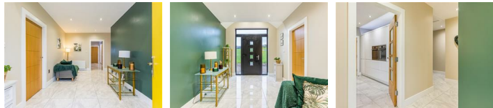
Reception Hall 8'11" x 16'11"

Bright, spacious hall with glazed door, high gloss tiled floor, spotlighting and double radiator. Beam vacuum system throughout the ground floor and garage.