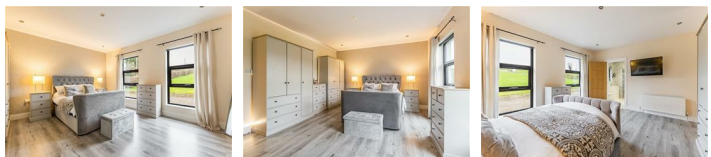
Master Bedroom 15'5" x 13'1"

Double window to front with wood laminate flooring. Double radiator and TV mount.