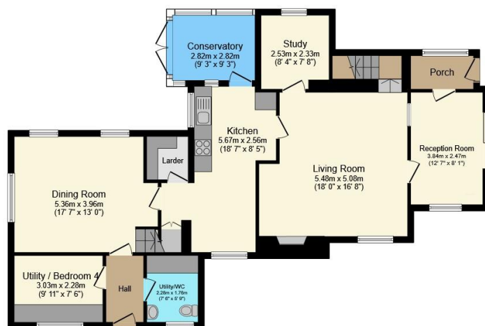
Ground Floor Floor area 107.3 sq.m. (1,155 sq.ft.)