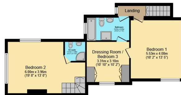
First Floor Floor area 62.8 sq.m. (676 sq.ft.)

Total floor area: 170.1 sq.m. (1,831 sq.ft.)