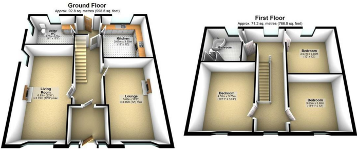
Total area: approx. 164.0 sq. metres (1765.4 sq. feet) Photos and Plans by houseafford.co.uk Plan produced using PlanUp