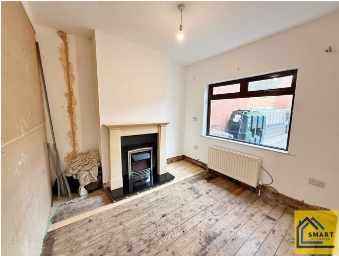
Lounge 9'9" x 9'6" (2.98 x 2.91)