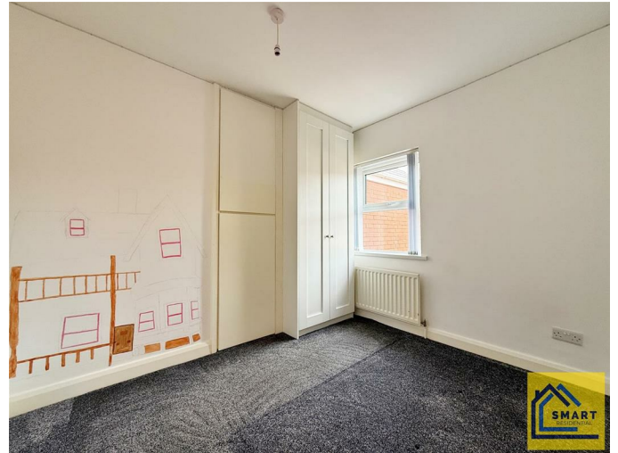
Bedroom 2 9'09"x 7'08" (2.97mx 2.34m )