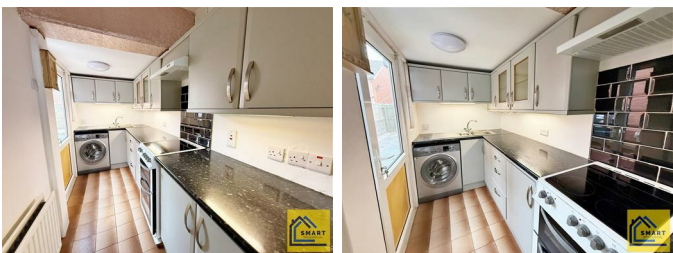
Kitchen 13'11"x 4'10" (4.24mx 1.47m )