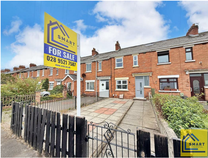
Upvc front door