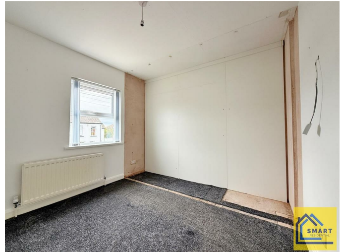
Bedroom 1 9'9" x 8'9" (2.99 x 2.68 )