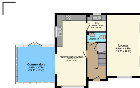
Ground Floor Floor area 77.6 sq.m. (836 sq.ft.)