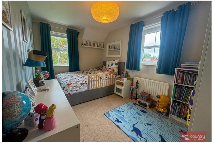
BEDROOM 3 8'1" x 9'7"