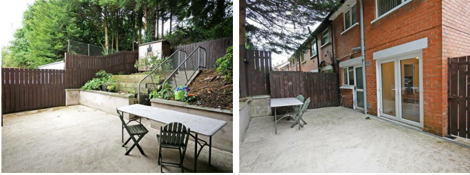
Enclosed rear garden with patio area bordered by timber fencing.