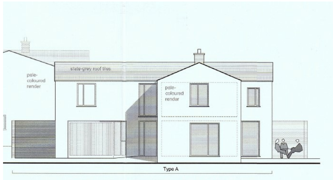
NORTH-WEST ELEVATION to Victoria Lane