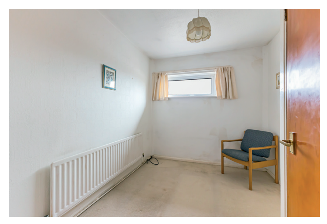
BEDROOM (4): 11' 4" x 6' 3" (3.45m x 1.91m) (at widest points). Outlook to side.

BEDROOM (3): 10' 0" x 8' 2" (3.05m x 2.49m) (at widest points). Outlook to side. Built-in storage cupboard.