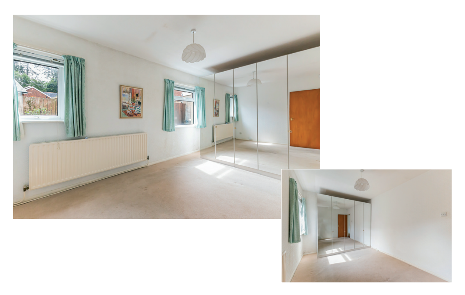
BEDROOM (2): 11' 9" \times 10' 0" (3.58m \times 3.05m) (at widest points). Outlook to side.

BEDROOM (1): 13' 9" \times 8' 9" (4.19m x 2.67m) (at widest points). Outlook to side.