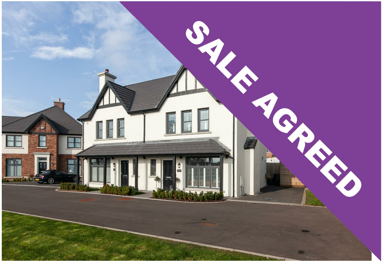
7 Barton Park Villas, Greenisland, BT38 8GH