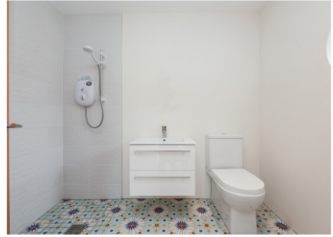
Bedroom 1 ensuite

Sheltered, recessed circular patio and barbecue area. Auto floodlights. uPVC oil tank.