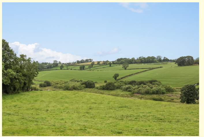
The combination of rural tranquillity with out-of-town convenience is not to be underestimated and provides a delightful space to call 'home'.

The interior offers four bedrooms and three reception rooms including a dramatic, reception hall and sitting are with a vaulted ceiling and access onto the rear terrace. The house 'flows' well with some rooms interconnecting with reception sapce at one ond of the house and bedrooms at the other offering quiet, comfortable surroundings to relax.