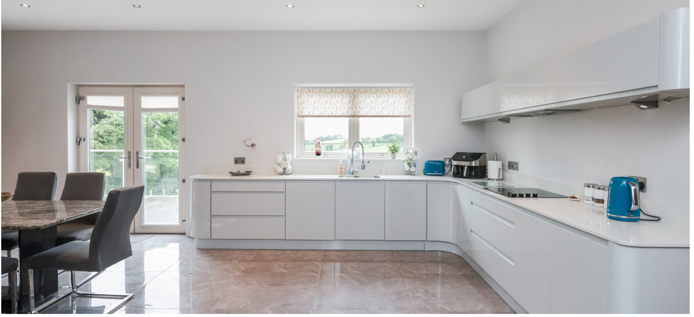
Magnificent kitchen with contemporary high gloss German cupboards