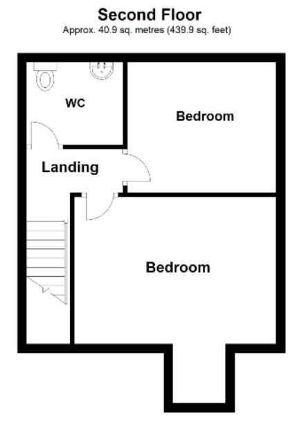
Total area: approx. 142.7 sq. metres (1535.7 sq. feet) This plan is for illustrative purposes only. Plan produced using PlanUp.