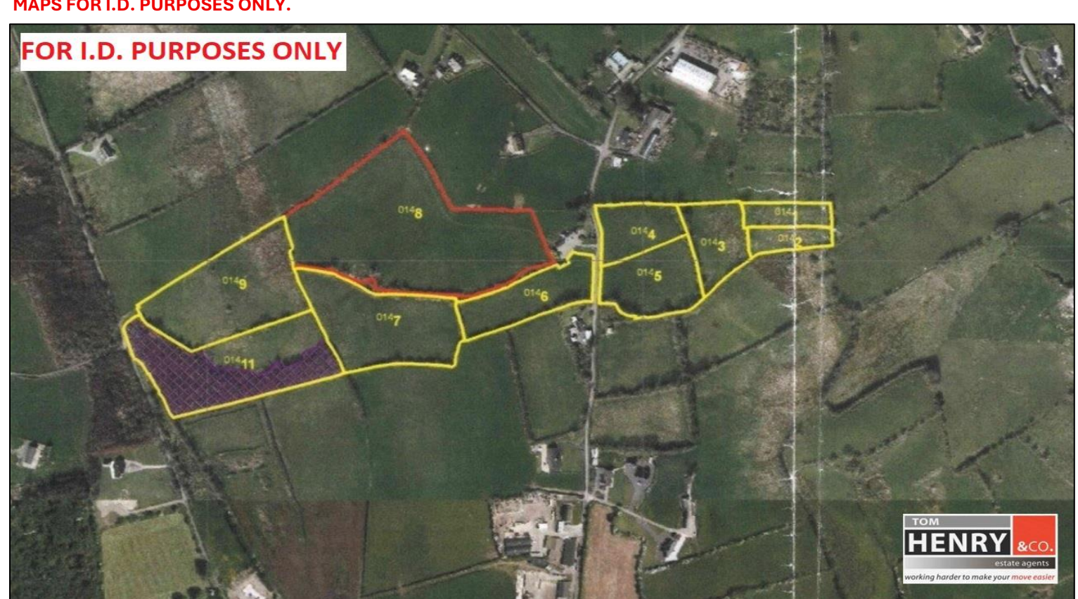
MAPS FOR I.D. PURPOSES ONLY.