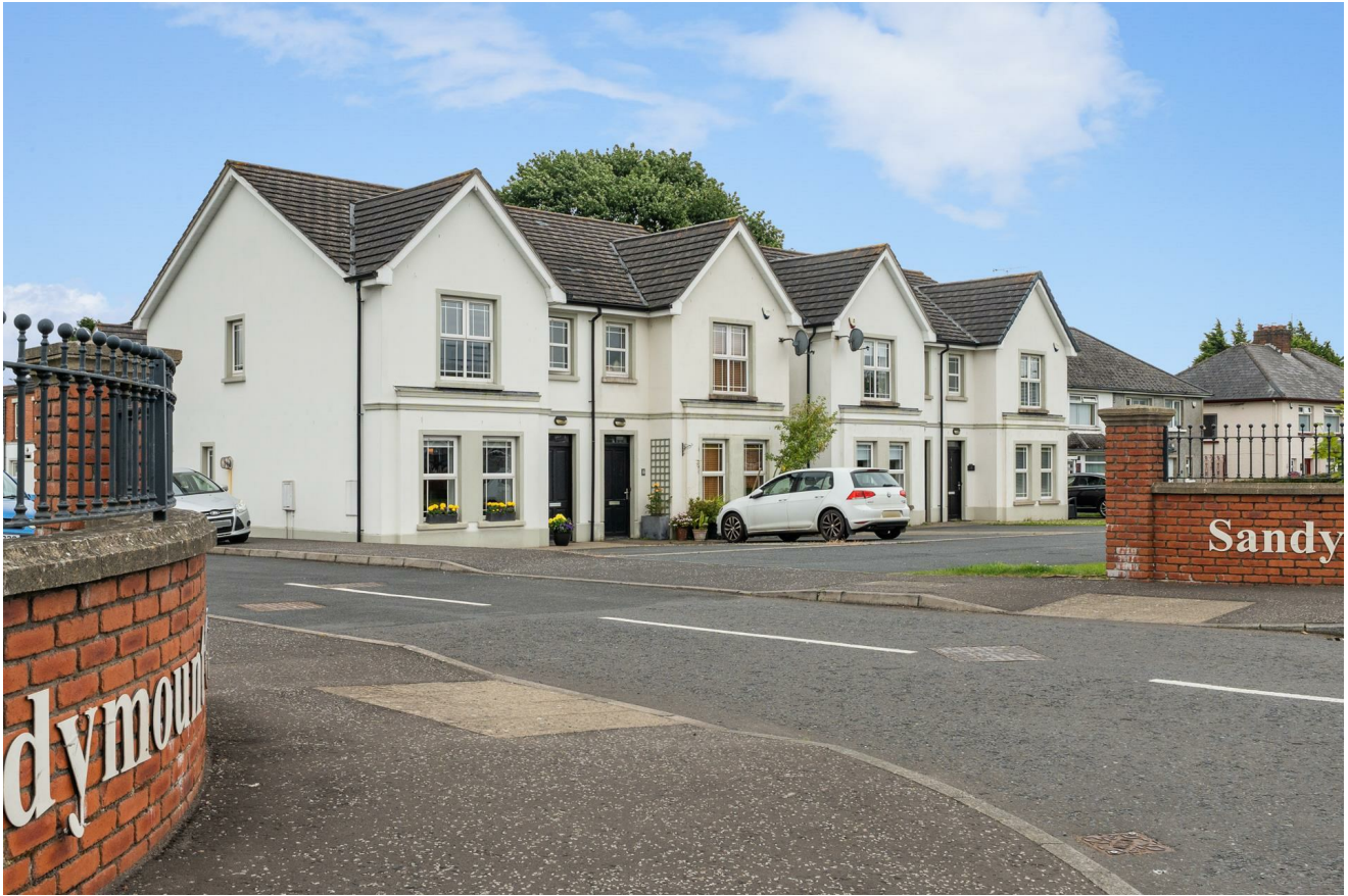
7 Sandymount Green, Newtownabbey, BT36 5FB