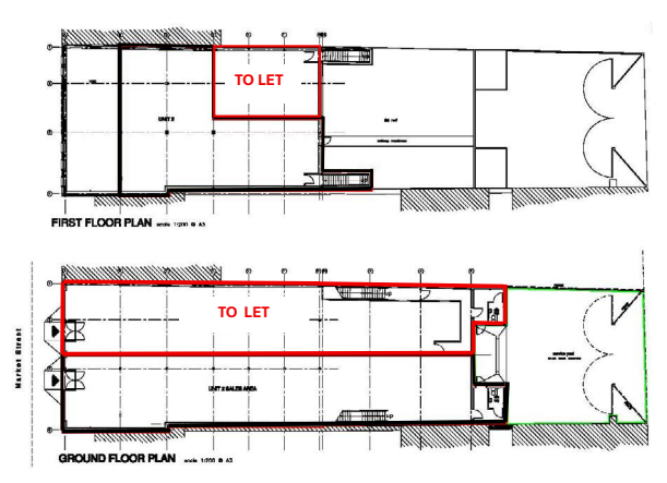
Not To Scale. For indicative purposes only.