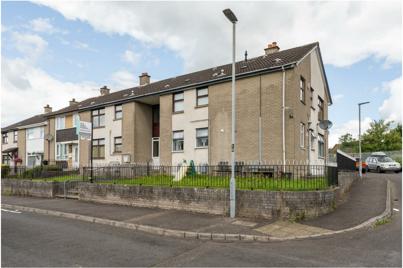
44C Tynan Drive, Newtownabbey, BT37 0HZ