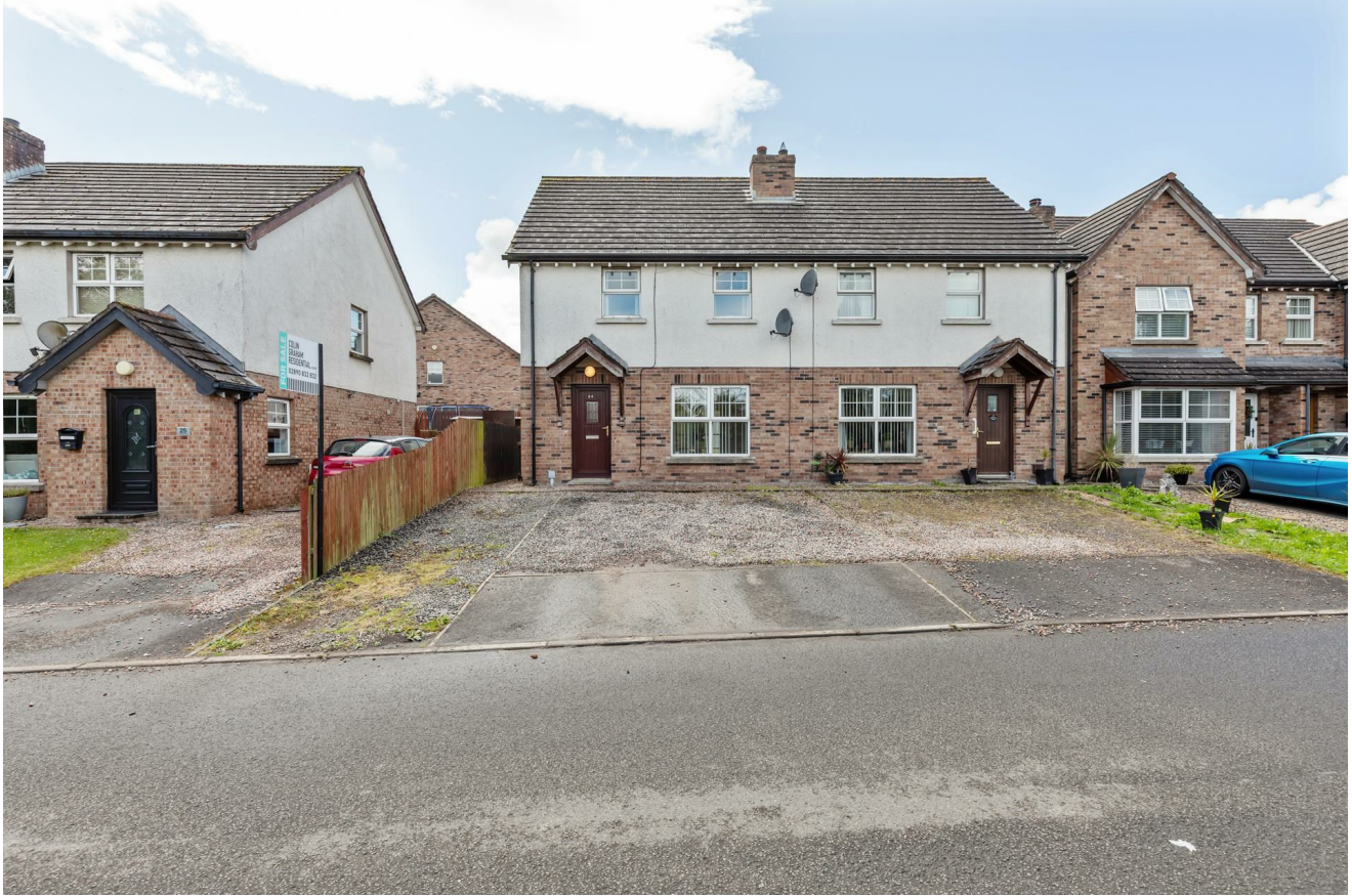
26 Lindara Drive, Larne, BT40 2FB