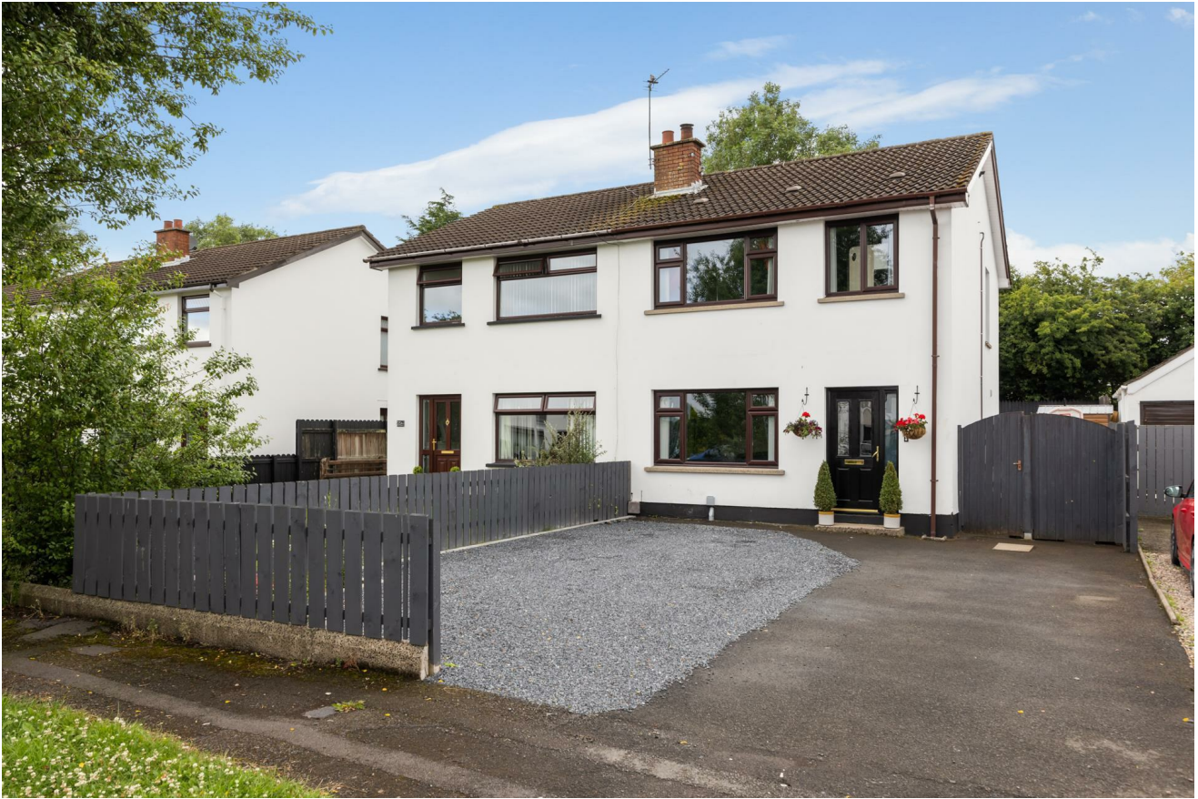
25 Clare Heights, Ballyclare, BT39 9HA