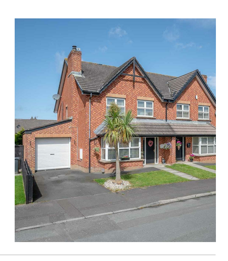
| 3 ⊨ | 0 ≒ | 2 ⊟