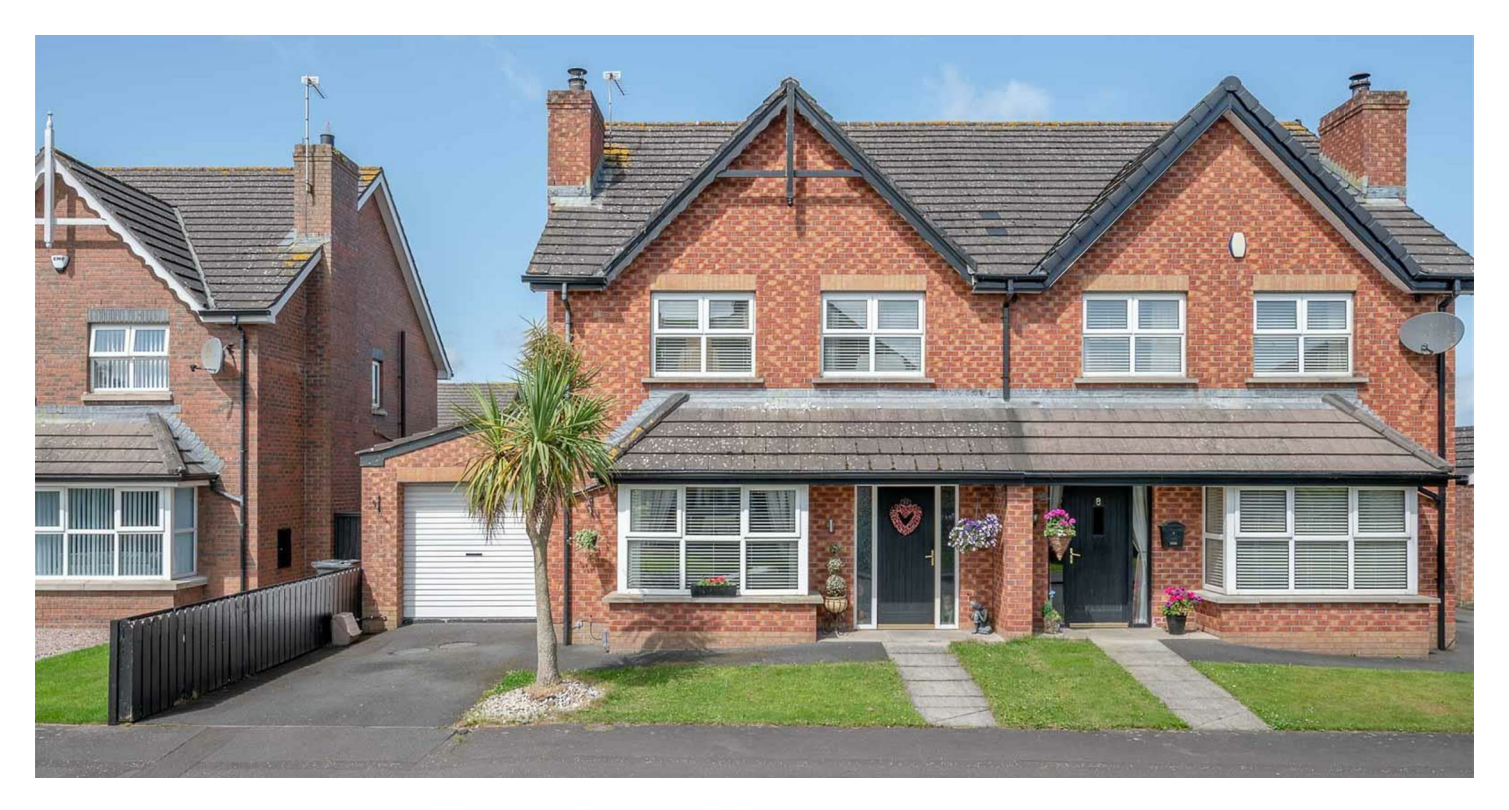
HOUSE - SEMI-DETACHED Add text here