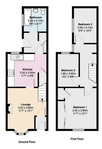
45 Rockdale Street, BELFAST, BT12 7PA