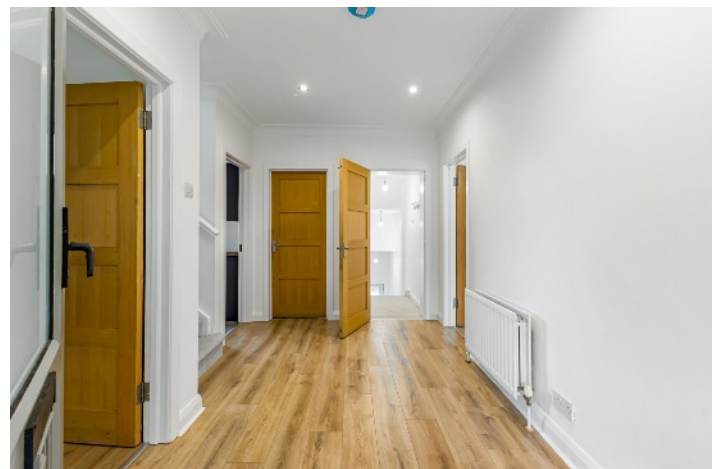
The Property Comprises: