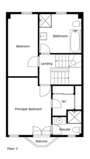
Sizes And Dimensions Are Approximate. Actual May Vary.

North Down - 028 90 42 4747 Lisburn Road - 028 90 66 3030 Ballyhackamore - 028 90 65 0000 Lisburn - 028 92 66 1700 www.templetonrobinson.com