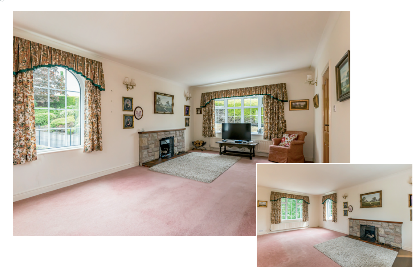
LOUNGE: 11' 6" x 11' 3" (3.51m x 3.43m) (at widest points). Mature outlook to rear.

LIVING ROOM: 22' 3" \times 12' 6" (6.78m \times 3.81 m) (at widest points). Triple aspect to front, side and rear, art deco style fireplace with wooden mantlepiece and stone inset with tiled hearth, cornice ceiling.