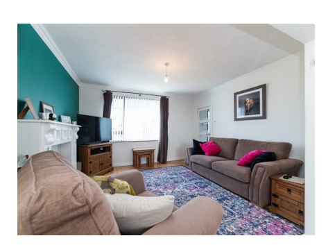
23 Kings Avenue Off Doagh Road, Newtownabbey, BT37 0DD