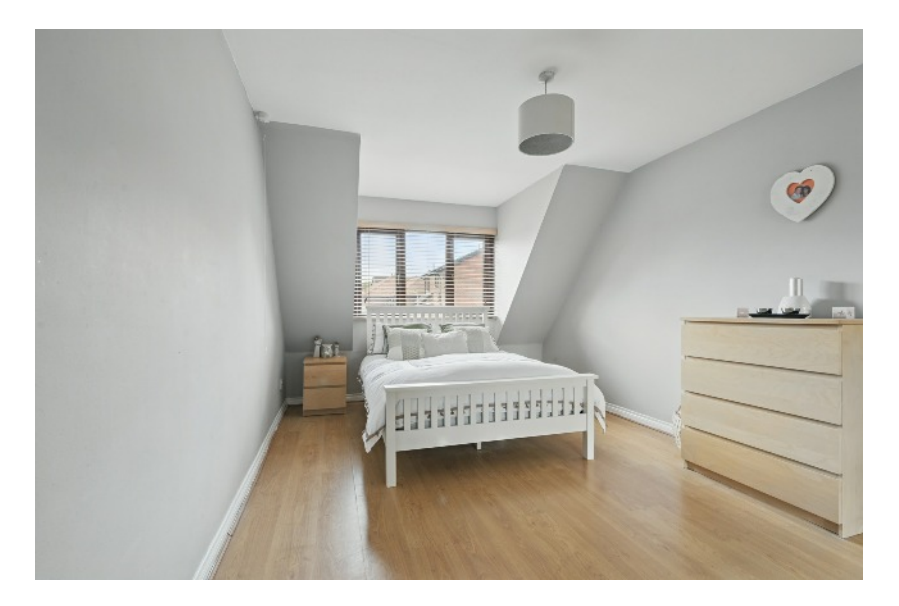
BEDROOM (4): 10' 6" \times 10' 2" (3.2m \times 3.1m) (at widest points). Outlook to rear.

BEDROOM (3): 15' 9" \times 10' 2" (4.8m \times 3.1m) Wood effect laminate flooring, built-in wardrobes with mirror fronted doors, outlook to front.