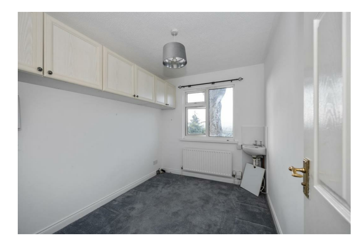
Built in robe. Sink unit. Fantastic views.