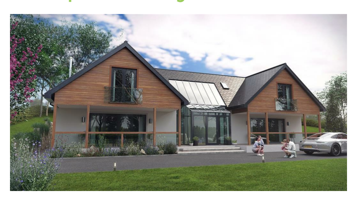
The CGI main image depicts how the end house could look based on the drawings and plans provided