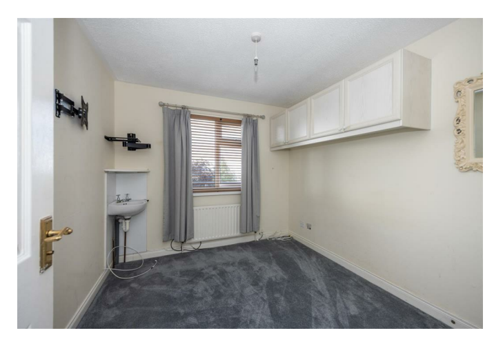
Built in robes. Sunk unit.