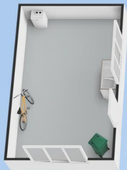
WORKSHOP / STORE 6.1m x 3.6m