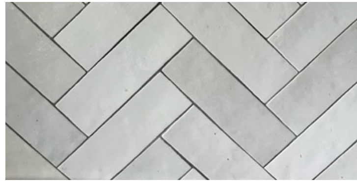
Village White herringbone tiles behind cooker