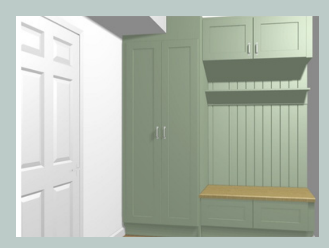
N.B - colour is for design/layout illustration purposes only

The spacious utility room featuring a handy 'boot room' area will be finished in the same stunning 'Reed Green' as the kitchen island.