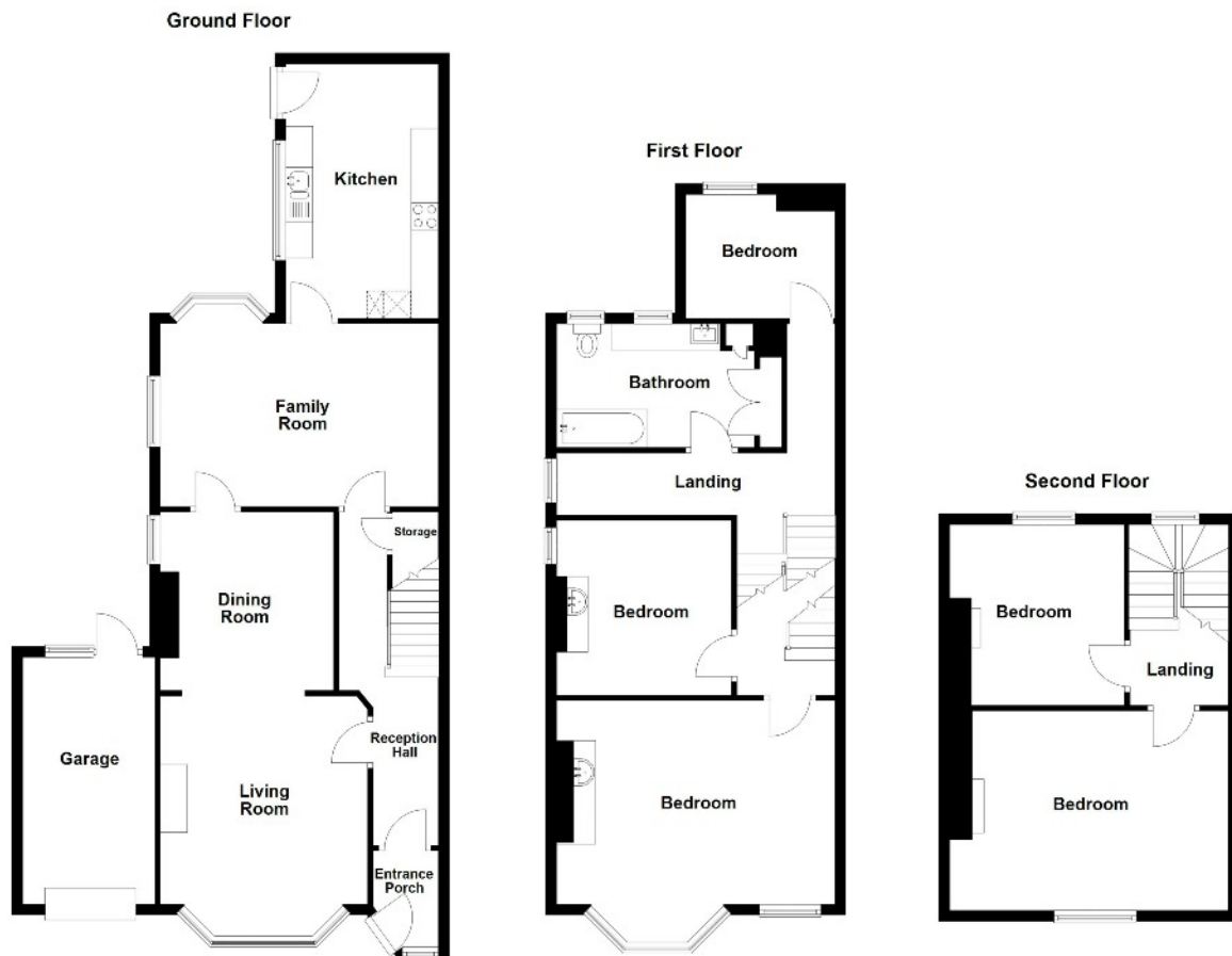
13 Cyprus Gardens, Belfast