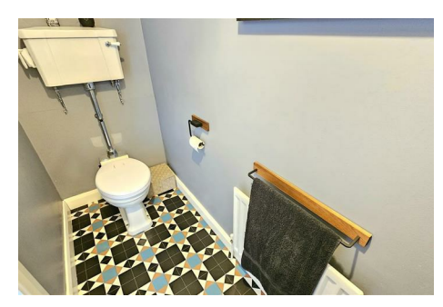
33 HIGHGROVE CRESCENT