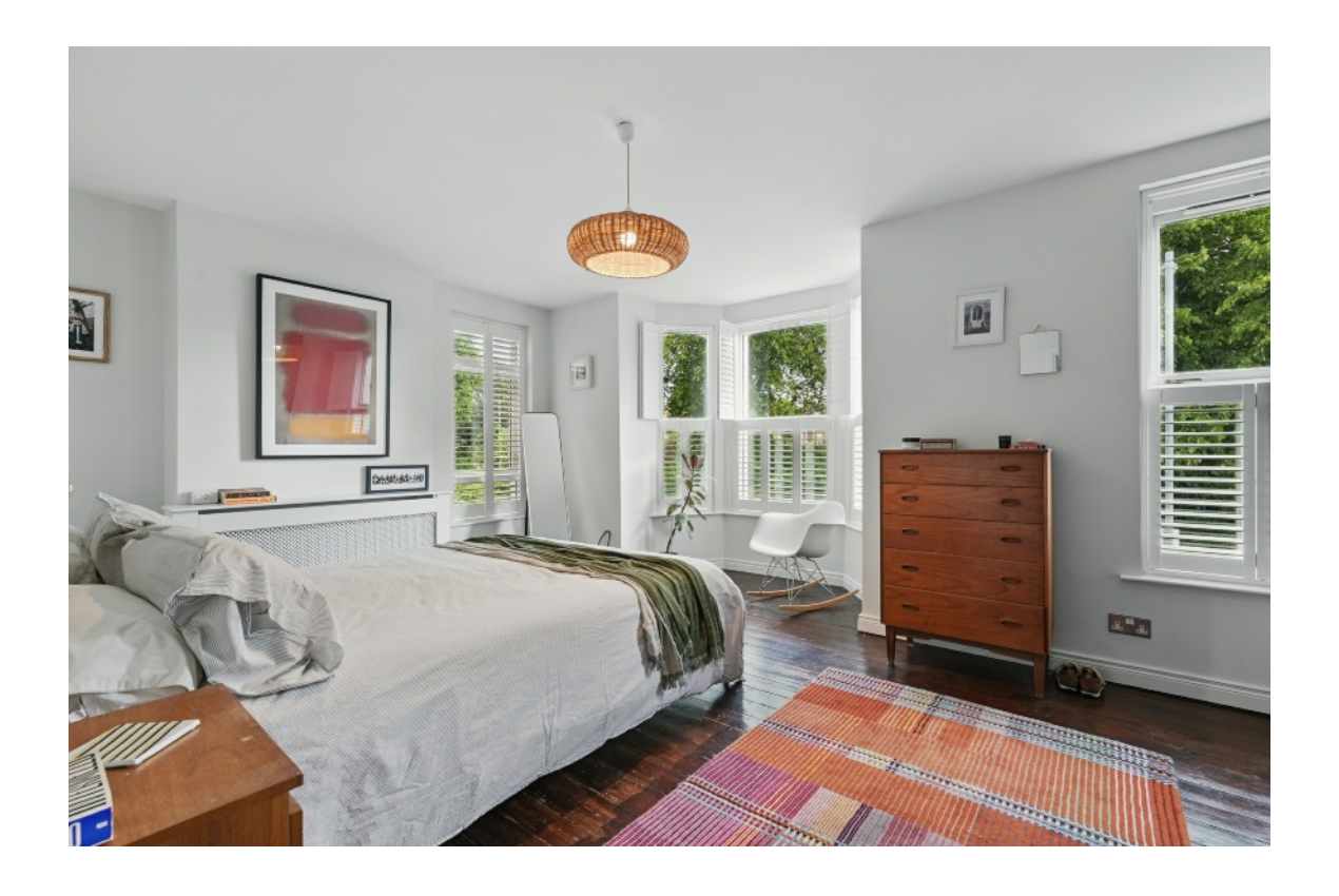
BEDROOM (2): 10' 11" x 10' 5" (3.33m x 3.18m)

BEDROOM (1): 16' 10" \times 13' 11" (5.13m \times 4.24m) Into Bay. Sanded and varnished floorboards.