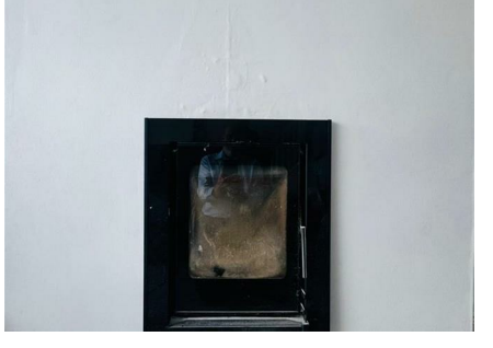
21 Harmin Avenue Glengormley, Newtownabbey, BT36 7UW