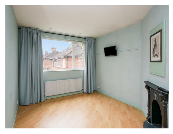
Dressing Area 9'7 x 6'4 (2.92m x 1.93m)