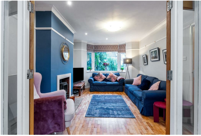
Living Area 12'5 x 10'5 (3.78m x 3.18m)