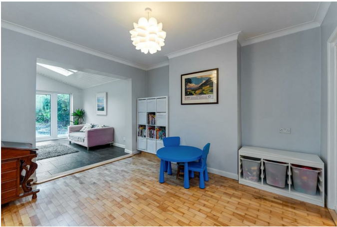
Wood strip flooring. Open to extended dining area