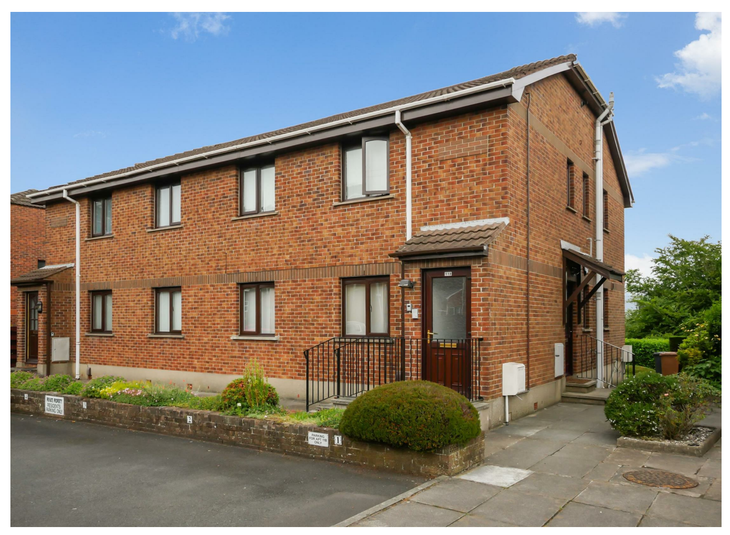
Apt, 11a Glencregagh Court, Glencregagh Road, Belfast, BT6 0PA Asking Price £165,000

028 9064 1264 forestside@ulsterpropertysales.co.uk