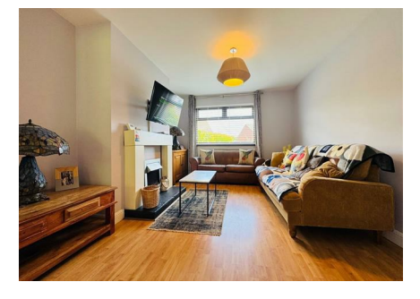
278C Whitewell Road Whitewell, Newtownabbey, BT36 7NL