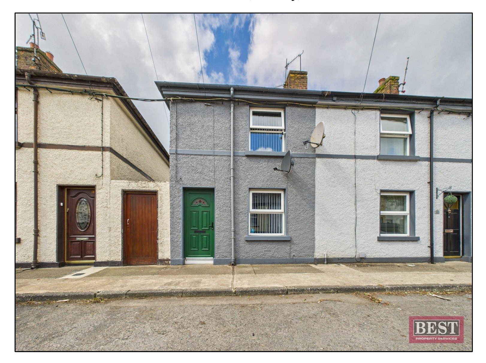
Asking Price £145,000